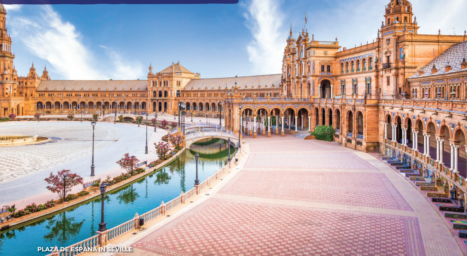
PLAZA DE ESPAÑA IN SEVILLE