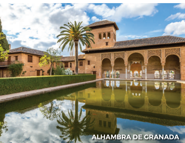
ALHAMBRA DE GRANADA

local guide, where you can admire the distinctive Gothic exterior of Valencia Cathedral and snap photos of the impressive Torres de Serranos , which was built to protect the city along the old city walls. Don't forget to make a stop at the City of Arts & Science , one of the most important modern tourist destinations in Valencia and considered one of the 12 Treasures of Spain. Tonight, enhance your dining experience with two variations of Paella - Seafood & Squid Ink Paella , and pair it with a glass of white wine to complement the flavors.