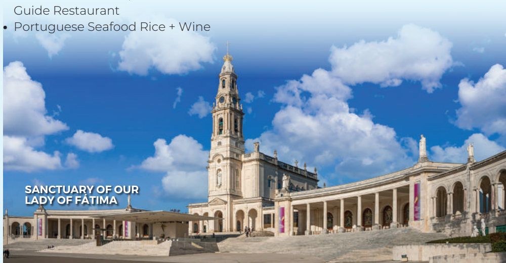
SANCTUARY OF OUR LADY OF FÁTIMA

*Note: Hotels subject to final confirmation. Should there be changes, customers will be offered accommodation similar to this list.